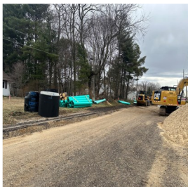
Sewer installation on Parkview