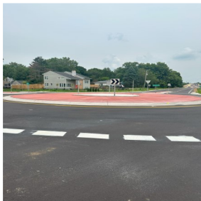
East facing view of the roundabout at 11th and Parkview

The shared use path, an 8 foot to 10-foot-wide facility, is anticipated to be completed with asphalt paving in 2024 from Vienna Street to Drake Road. This segment was prioritized in the Master Plan for the access it provides to schools, residential areas and the broader non-motorized network. The plan also called for it to continue west on Parkview to Stadium Drive and Flesher Field, and the Township will pursue those opportunities next.