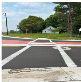
West facing view of the roundabout at 11th and Parkview