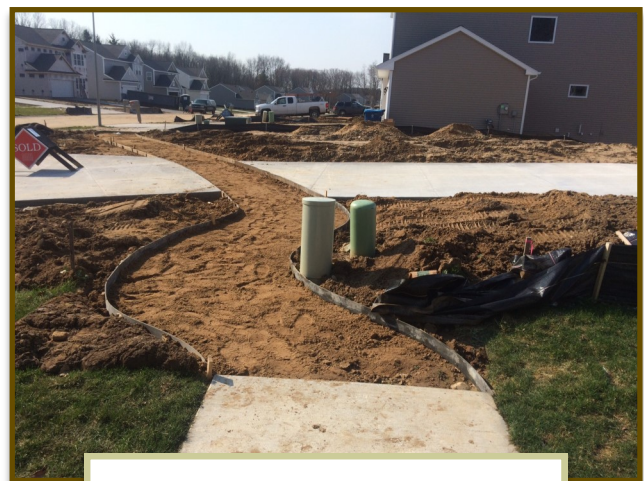
Sidewalk Installation Inspection