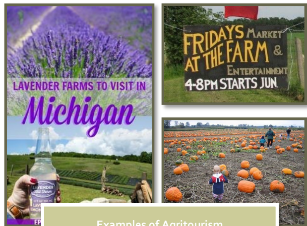
Examples of Agritourism

The Planning Commission began working on this new ordinance in April of 2018. The Agribusiness/Agritourism ordinance is designed to provide those who either produce an agricultural product or live in the rural area and meet certain criteria the opportunity to generate some additional revenue on their property. The objective is to offer additional options for these property owners without impeding the enjoyment of the rural character of the area. It is not the intent of the ordinance to allow commercial operations within the rural area of the Township and therefore, some uses, like special events, have been limited.