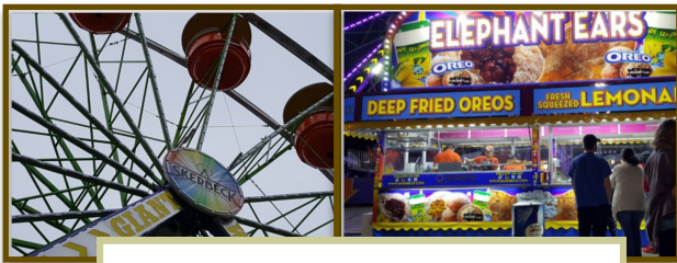
Oshtemo Rotary Family Festival

Six of the Special Exception Uses were approved for temporary outdoor events within the Township, which is four more than in 2017. These included the Oshtemo Rotary Family Festival, Jake’s Firework’s Tent Sales, D & R Sports Spring Open House, a summer Barn Camp for children, and two businesses allowing food trucks on their property. The Thirsty Hound on 8th Street and Lawton Ridge Winery on Stadium Drive both hosted weekly food trucks throughout the summer months. The Oshtemo Rotary Club’s event was the second annual community festival fundraiser that included midway rides, concessions, and games.