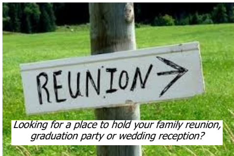
Looking for a place to hold your family reunion, graduation party or wedding reception?

Please note the Township Office hours are Monday-Thursday 8:00 a.m.–5:00 p.m. and Friday 8:00 a.m.–1:00 p.m. We are closed Saturday and Sunday. Taxpayers can use the drop-box in the parking lot, which is monitored and checked daily.