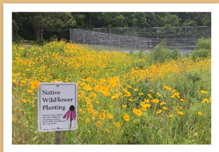
Oshtemo Township Park